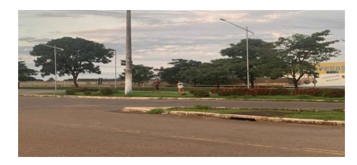
Figure 3. Sample of Daily Traffic

inconvenience to the population. It waspossible to observe that there is a lack of support in the stretches of road crossings that cut certain cities in half, specifically the city of Gurupi - TO. When analyzing the images and data collected, it is a determining factor that security must be a priority for quality public management in a municipality. Ferraz (2017) statesthat within the scope of Road Engineering and Traffic Engineering, the main actions to improve traffic safety are: projects for new highways and expressways with an emphasis on safety, treatment of critical locations, improvement of road maintenance, improvement of signage, definition of operating conditions with an emphasis on safety (reduction of the speed limit, prohibition of dangerous turns, etc.), use of measures to reduce speed (bumps, lane narrowing, etc.), use of of electronic inspection devices (radars, red light detectors, etc.), improvement of lighting in places with a high incidence of accidents at night, etc.All these alternatives for improving traffic come to offer safety and comfort to road users who need to cross.