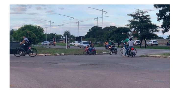
Figure 2. South interchange with interaction between cyclists and motor vehicles

Afterobtaining data for 3 (three) months of research, they were filtered and analyzed to verify the time of greatest traffic. The criteria used were: greater flow of vehicles in a month, week and day. With the data in the table below, the intense flow of non-motorized vehicles and pedestrians is visible at all times of the survey, showing that intervention is necessary to improve the safety infrastructure of the most fragile users. The research was carried out during business hours to verify the barrier effect, and its transposition becomes a meticulous journey. It was found that peak hours have a greater flow, as expected, causing a lot of