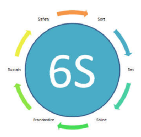
Figure 1: 6S method processes

It was first used by Toyota in 1970. This method used by many organizations after that. But safety is not main priority in this method. The main aim of invention of 6S method was to give priority to the safety as well as quality and performance. The 6S method can be implemented in all type of organization or companies. The safety is the main concern in manufacturing companies and all other organizations in the 21<sup>st</sup> century. So, 6S is the best method to implement in the organizations to achieve high quality, high performance and high safety in the work environment.