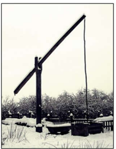
Figure 1. A shadoof well

The research of the flora of diatom Bacillariophyta in the draw-wells in the area of Semberija (Ćurčić 1985, 1992, 1993, 1996), as well as the research diatom flora in the draw-wells in Posavina (BiH) (Jerković, 1981), represent the first and only research of this flora in our country and in the world so far. Draw-wells are characteristic of the climate in these areas and are traditional sources of drinking water (Figure 1 and Figure 2).