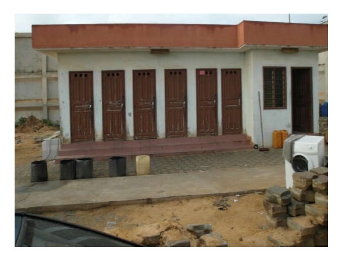
Figure 7. Picture showing a toilet cabins in the Port of Cotonou area

In the port area, excreta are evacuated by an autonomous sanitation system. This system consists mainly of latrines carried out by the port authority or by private operators operating on the port platform. It is characterized by flush latrines each connected to an individual septic tank. Most private operators have built flush toilets on their own funds to serve their staff. Thus, 67 latrine cabins (figure 7), 53 showers and 13 urinals were counted in the port area. The number of users is about 700 people. However, most of the private structures do not allow users who are not part of their staff to access their facilities. Among the private structures that allow access to their places of comfort to all users are the company ORYX which deals with the storage, transport and distribution of hydrocarbons. This company drains more than 300 people daily and has at its disposal nine showers exclusively reserved for users. Apart of the above mentioned company, we can mention FSG, which handles communication on fish products, which reserve two modules of eight showers and four latrine cabins. The figure 7 shows a toilet infrastructure within the autonomous port of Cotonou built by port authorities.