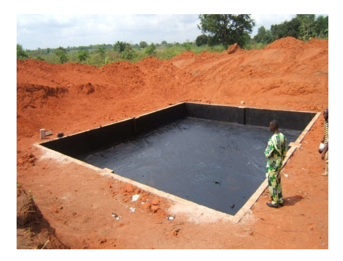
Figure 6. Tomb carried out for the destruction of the batteries (dangerous products)

The use of this method would be justified by the efficiency and the rapidity of destruction known to the fire. The application of this method is certainly effective, but with consequences on the environment. Pollution of air, soil and, if possible, water (depending on the depth of the water table), are the impacts that this destruction can have on the environment. Burial: This method can be used for the destruction of damaged products consisting in putting the damaged products in a large pit, to spray them with denaturing products and to cover them sand.In case of dangerous products, during the destruction process, the bottom of the pit is covered with a layer of reinforced concrete, and the walls cemented. So for each layer of hazardous products buried, a layer of concrete is deposited until the total burial of the hazardous products (Figure 6). The figure 6 illustrates one of the destruction methods used in the management of damaged products. The method used here is that of burial but with the particularity that it was realized in the form of tomb. This particularity in this case of burial is due to the nature of the product to be buried which is in this case, batteries. The choice of this method of destruction is due to the chemical composition of the batteries, in particular mercury, the effects of which are dangerous for man and the environment, if it were buried simply.