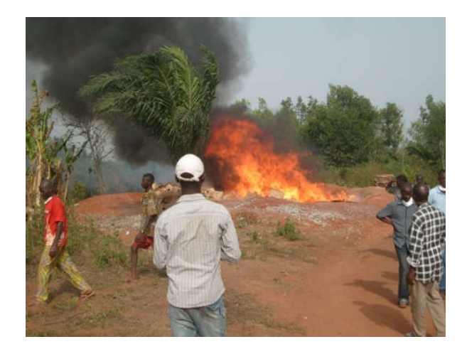
Figure 5. Picture showing the Incineration of a waste product coming from the port

Incineration : It is a technique for the destruction of waste by the action of fire; it is also a thermal treatment of refuse in an appropriate oven in the presence of excess air and whose heat collected is partly transformed into energy (Adissin, 2008). The incineration method is shown in the picture 5. As the picture shows, this destruction necessitated the digging of a large pit, the size of which corresponds to the quantity of the damaged products to be destroyed. For example, for the chicken legs, it must be removed from their packages, be placed in the pit where thousands of liters of gasoline will be spilled, followed by firing.