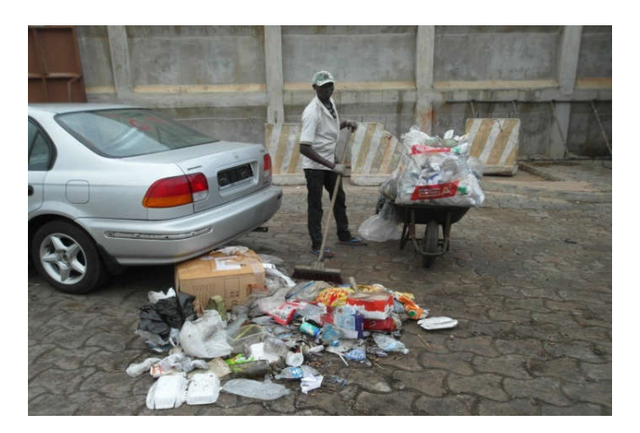
Figure 1. Picture showing a garbage collection process

The method of managing garbage produced by the various port actors is for the most part limited to their periodic removal from the port by the pre-collection structures. These structures deal with the cleaning and removal of waste (figure 1).