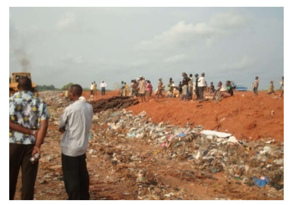
Figure 4: Destruction Operation in the Presence of populations Several methods of destruction are used

There are several reasons for the abandonment of goods by importers (problems between importers and exporters, death of the owner of the goods, etc.). It should be noted that the initiation of the product destruction process allows the importer to take possession of his funds from suppliers, if they are insured. The documents issued are sent, in the case of dangerous products, to the Environment Agency for a certificate of environmental compliance, which allows the destruction of the product on the national territory. It should be noted that in the case of dangerous goods, Environmental Impact Assessments are carried out and their destruction requires a duly signed authorization from the Minister in charge of the Environment. Figure 4 shows the conditions under which the destruction of damaged products is often carried out. In this picture, we observe the presence of the populations bordering on the site of destruction which at the slightest drop of vigilance of the forces of the order present on the place, seize the damaged products either to consume them, or to resell them.