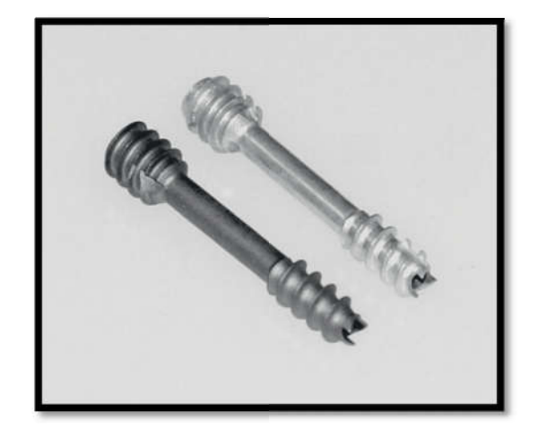
Figure 1. MAGNEZIX compression screw Courtesy of Syntellix AG, Hannover, Germany

osteoconductive properties and no allergic reactions (Waizy, 2014; Witte et al., 2008). Thus it has been used as a substitute for titanium screws in both orthopedic and maxillofacial surgeries. A study conducted on 26 patients, to fix mild hallux valgus using MAGNEZIX compression screws (Syntellix AG, Hannover, Germany) (Figure 1) has shown improved osseointegration with better bone density. Furthermore, no negative effects such as complications, pain or allergic reactions were observed. The production of gas inherent to magnesium degradation generated neither bone erosion nor necrosis. The independent authors concluded that there was an equivalent clinical outcome between both types of screw, and recommended a larger and longer follow-up study (Windhagen, 2013).