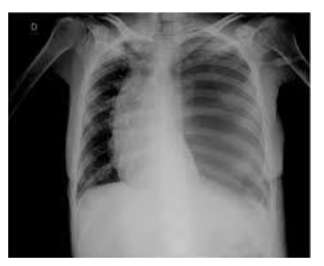
Gas under Diaphragm