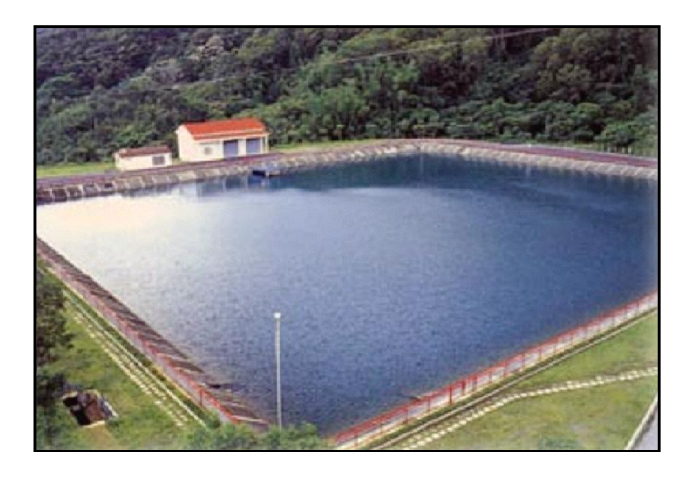
Figure 4. A lined open water pond in Taitung, Taiwan