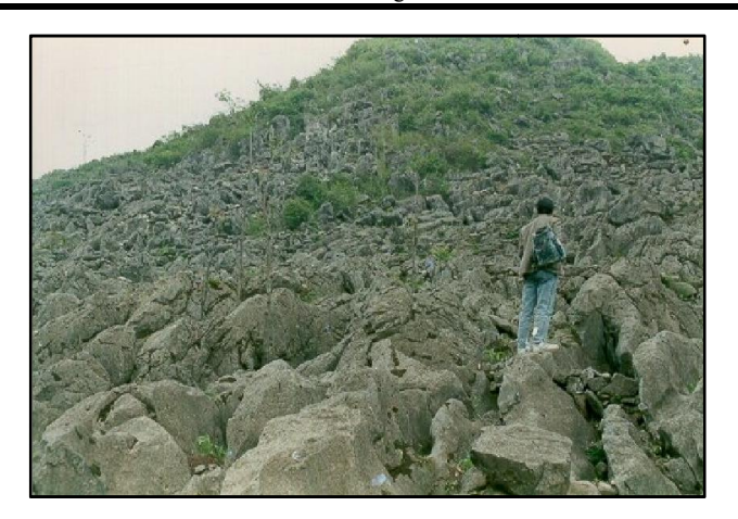
Figure 1. Typical landscape of a rocky desert in southwest China (Yuan, 1997)