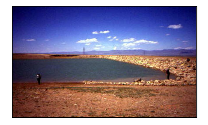
Figure 3. Earth embankment to retain rainwater for groundwater recharge in Iran