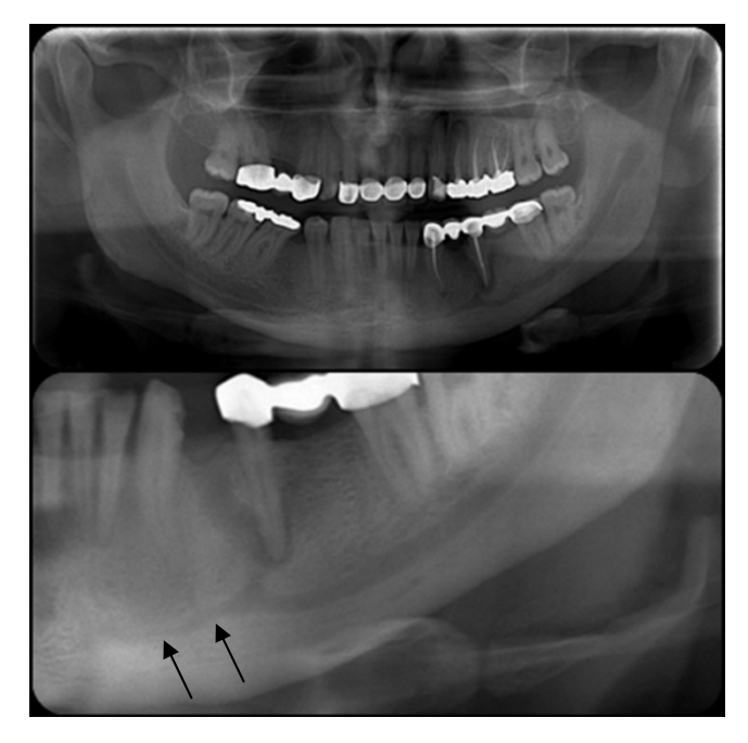
Fig. 2. Digital panoramic view of the MIC (black arrows)

All radiographic images were examined by the same observer (MT) in a dark room and in the same computer [Intel® Xeon® E5-2620, 2.0GHz; NVIDIA quadro 2000; 32" Dell T7600 workstation with a resolution of 1280 x 1024 pixels, 8GB memory, Windows 7 operatingsystem]. The observer performed re-examination in 2-week intervals to evaluate intraobserver variability. The examiner had to answer yes or no regarding the presence of MIC at least one side of the mandible in the images obtained with panoramic machines. The prevalence in percentages was calculated for MIC in panoramic radiographs. Statistical analyses were carried out using the SPSS software (ver. 21.0.; SPSS Inc., Chicago, IL, USA). Kappa statistics were applied for assessment of intraobserver agreement. Chi-squared test was used to find out the relationship between the MIC and age groups, MIC and gender. P values less than 0.05 was considered to be significant.