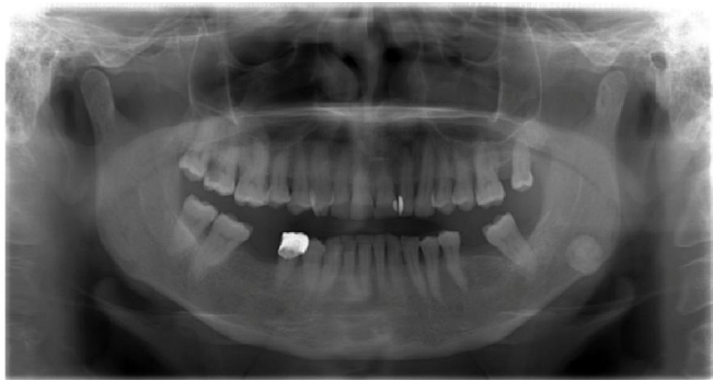
Figure 1. Panoramic radiograph of the patient diagnosed with submandibular sialolithiasis

Extraoral radiography: Panoramic images could be both distorted and magnified, which means that unreliable results could be produced (Miloğlu et al. 2010) (Figure 1). They frequently demonstrate sialoliths in the posterior duct or reveals intraglandular sialoliths in the submandibular gland if they are within the focal trough. The image of most parotid sialoliths is superimposed over the ramus and body of the mandible at the level of or just superior to the occlusal plane, making oblique lateral radiographs of the mandible of limited value (White and Pharoah 2014). Parotid glands can be visualized in anterior posterior (AP) projection with extended chin, open mouth and cheeks puffed out to show Stensen's duct lesion. The submandibular gland can be visualized in AP and ipsilateral oblique projections with extended chin, open mouth and the tongue pressed down in the floor of the mouth (Afzelius et al. 2016; White and Pharoah 2014).