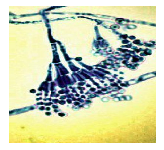
Plate 2. Penicillium notatum