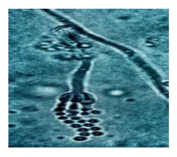
Plate 4. Penicillium chrysogenum

Soil dilution plate Method : The soil samples were mixed with sterile distilled water in equal volume and a series of dilutions were made.