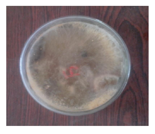
Plate 1. Culture plate showing Penicillium culture