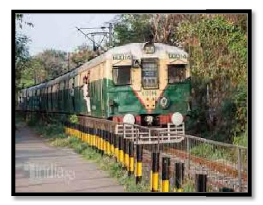
Fig. 5. Rail way Transport

Railway brings together people from the farthest corners of the states and makes possible the conduct of business and other purpose. Indian railways help the government have been a great integrating force during last hundred years. It has bound to economic life of the state and helped in accelerating the development of industry and agriculture.