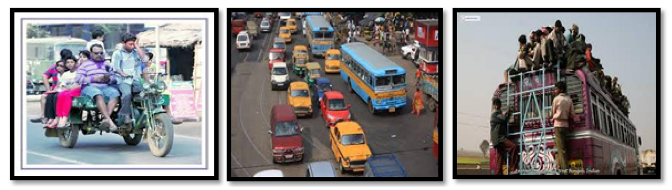
Fig. 4. Road Transport

Pipeline is the most convenient and suitable mode of transport for the movement of the petroleum products and gases in bulk over long distance.