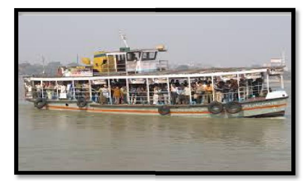
Fig. 6. Water Transport

Water Transport is a most greatly and quickest transport system in West Bengal. The Ganga between Allahabad and Haldia, the long water transport route of West Bengal. Water transport is also known for higher employment generation potential. Its operation is currently restricted to a few stretches in the Ganga-Bhagirathi and Hooghly River.