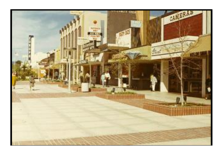
Figure 7. The condition of 3rd Street in the 1970s

Santa Monica is a beachfront city that located in western Los Angeles Country, California, United States (Figure 4). The example study of this research is 3<sup>rd</sup> street which is major shopping street in Santa Monica city (Figure 5). This street during 1950s was very busy Commercial Street, free for cars (Figure 6). A significant change has occurred in 3<sup>rd</sup> Street during 1958 when president of the Chamber began the creation of a unique organization named The Santa Monica Tomorrow Committee for the purpose of "looking ahead and planning for the future" (Pojani, 2005). In 1960 three blocks of this street were converted into a pedestrian mall that new body concluded for this street to return the engine of commerce in downtown of Santa Monica (McGuigan 2003a). Los Angeles Times, (1986) stated that designing a pedestrian shopping area in the 1960s was going to put out traffic congestion from this area (Figure 7).