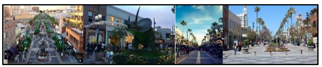
Figure 8. The condition of 3rd Street after the 1990s

From social interaction perspective, social participation has significant impact on social sustainability from various ways.