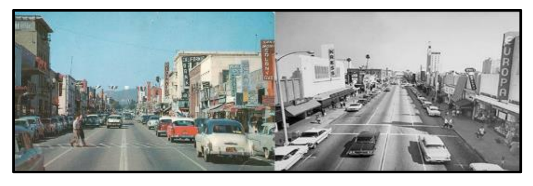
Figure 6. The 3rd Street in the 1950s