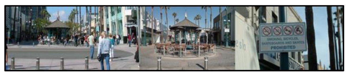
Figure 12. Non-Removable Traffic Barriers in the 3rd Street