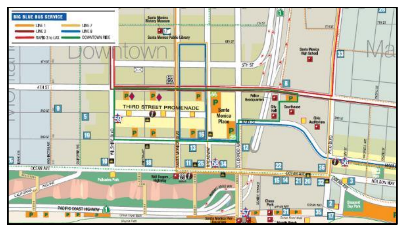
Figure 9. The Location and access of Parking Areas, public services and public transportation around 3rd street