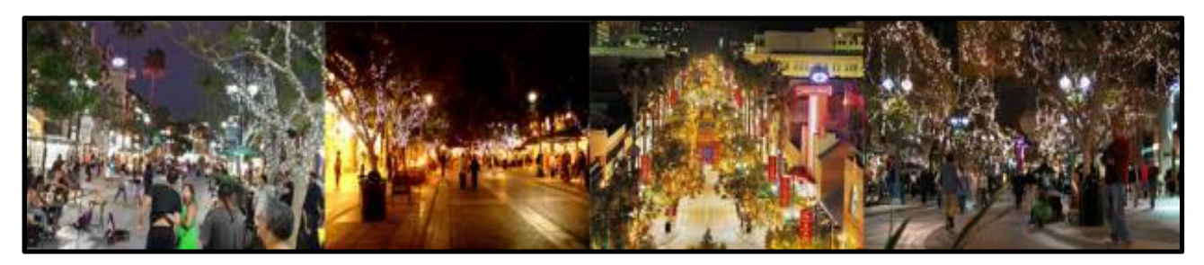
Figure 11. Quality of lighting in the 3rd street (Source: URL1)