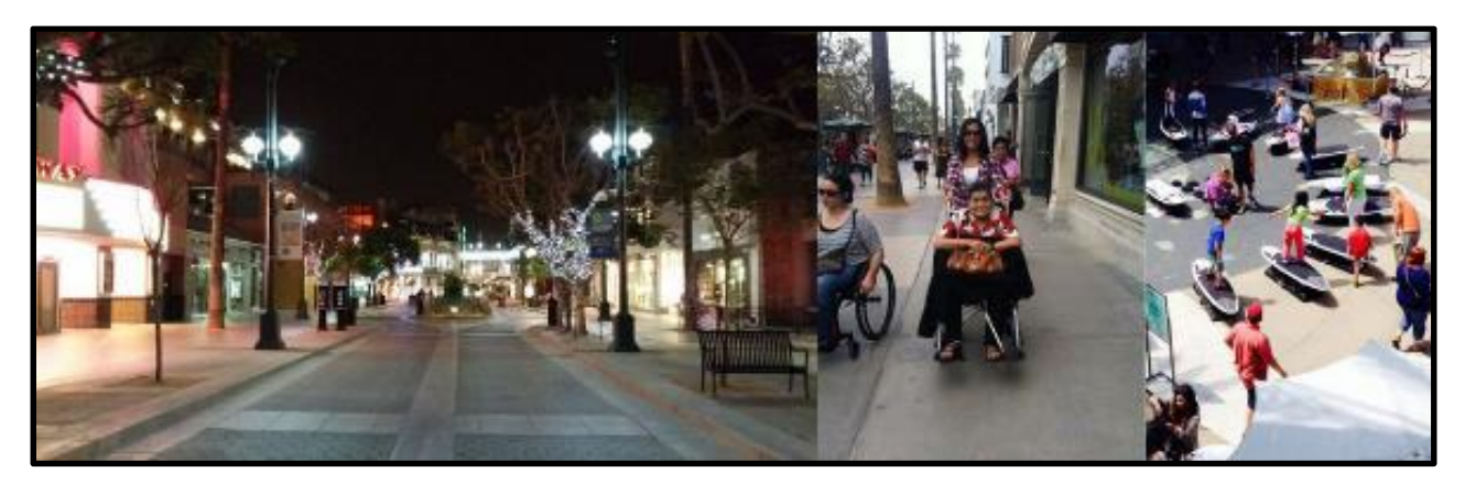
Figure 10: Quality of Pavement, Furniture and accessibility in the 3rd street