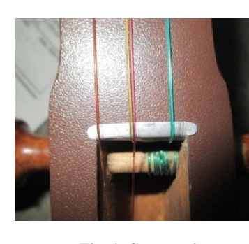
Fig. 1. Saraswati