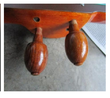
Fig. 3. Kaan