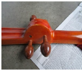
Fig. 12. Chutki

Fig. 15. Back side of Kaan Ghora / Chamber