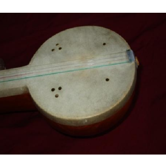
Fig. 9. Dugi/ khuli