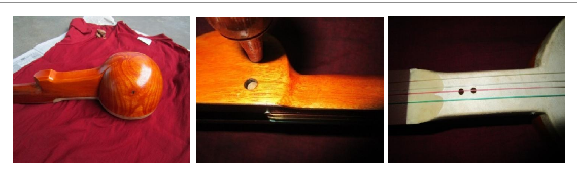
Fig. 16. Back site of Khuli