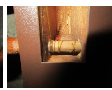
Fig. 2. Kaan Ghora