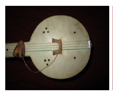
Fig. 10. Ghora & Chutki