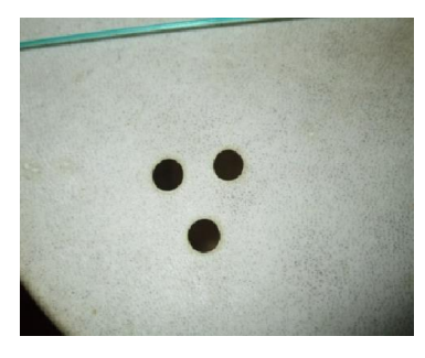
Fig. 4. Mukut / Sehera