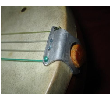
Fig. 8. Neura