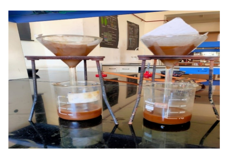
Partitioning of Crude Drug Extract

Percolation: This is the procedure used most frequently to extract active ingredients in the preparation of tinctures and fluid extracts. A percolator (a narrow, cone-shaped vessel open at both ends) is generally used. The solid ingredients are moistened with an appropriate amount of the specified menstruum and allowed to stand for approximately 4 h in a well closed container, after which the mass is packed and the top of the percolator is closed. Additional menstruum is added to form a shallow layer above the mass, and the mixture is allowed to macerate in the closed percolator for 24 h. The outlet of the percolator then is opened and the liquid contained therein is allowed to drip slowly. Additional menstruum is added as required, until the percolate measures about three-quarters of the required volume of the finished product. The marc is then pressed and the expressed liquid is added to the percolate. Sufficient menstruum is added to produce the required volume, and the mixed liquid is clarified by filtration or by standing followed by decanting.