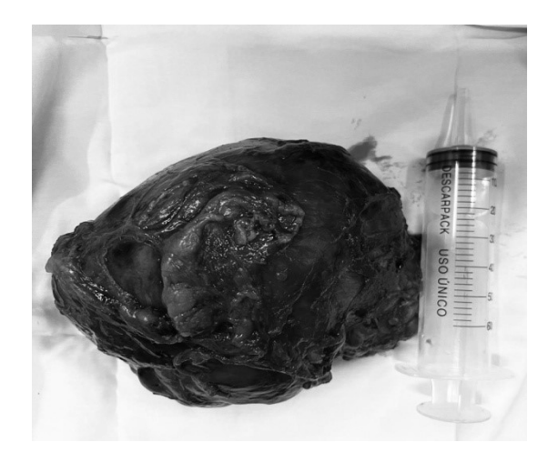
Figura 2. Surgical specimen