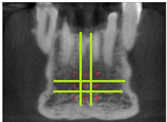
Figure 1. Classification of lingual foramina according to their localization in the anterior region of the lingual surface of the mandible

Data Analysis: The data were digitalized and organized in the Statistical Package for Social Sciences (SPSS for Windows®, version 20.0, SPSS Inc. Chicago, Ill, USA). The statistical analysis involved the distribution of frequencies of lingual foramina and tests of association. The chi-square test was used to compare the variables age, side of foramina and type of dentition between males and females. In addition, the Kolmogorov-Smirnov normality test was performed to verify the normality of data distribution. According to the results, the independent samples t-test or Mann-Whitney test were used to analyze linear measurements. The significance level was set at 5% ( P < .05 ).