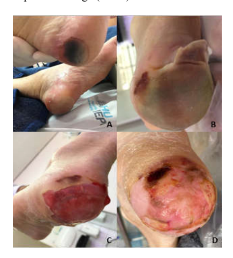
Figure 2. Pressure injury on the left calcaneus

A: Initial appearance of the lesion, without dressing and photobiomodulation; B: Aspect of the lesion after debridement by the medical team and application of photobiomodulation and dressing; C: Aspect of the lesion on the day of hospital discharge; D: Aspect of the lesion after hospital discharge (home).