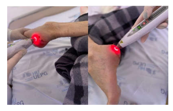
Figure 3. Photobiomodulation approach during hospital stay

Physiotherapy: During hospitalization, the patient was attended by physiotherapy professionals, with different approaches according to his needs. During the period he was in the ward, the patient performed active-assisted muscle strengthening exercises with progression to active and isometric (upper limbs and lower limbs) with the aid of physiotherapy at least once a day, as well as being oriented to the patient and companion on the continuation of them alone at other times of the day, trunk control training, posture change training (lying to sitting and sitting to standing), gait training with the aid of an auxiliary gait device (walker), training balance (dynamic and static), breathing exercises (ventilatory patterns, reexpansive maneuvers and intermittent positive pressure breathing -IPPB) and photobiomodulation in the pressure lesion in the left heel with a dose of 2 Joules, with punctual application throughout the lesion region, associating the red type with infrared, to improve tissue regeneration, vasodilator action and analgesia (FIGURE 3).