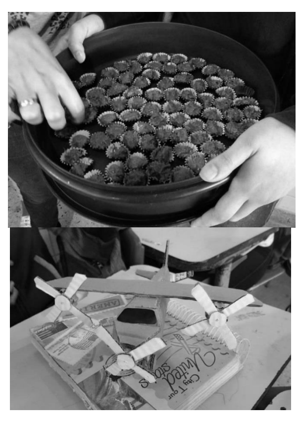
Figure 4. Objects produced using garbage

already been shown, it can be seen that there are several means of awareness, which can be used in the school environment (Santos et al., 2016). At the end of the activities, a workshop was held with recyclable materials, and at this moment the class was divided into groups for making objects using such materials. In this activity, several types of objects were obtained (Figure 4). Among the productions, organic waste was used to make a brigadeiro, which was used for banana peel as the main ingredient, showing that there are sustainable ways to use organic material. Another object made during the workshop was an airplane using cardboard that is widely discarded in supermarkets, being classified as commercial waste, it is a material that causes a lot of accumulations in the streets in front of the shops, and could be recyclable or reused for the manufacture of so many other materials.