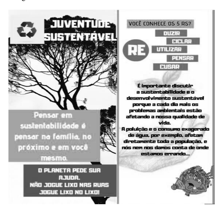
Figure 2. Sustainability pamphlet

the school and the places where they present the greatest production of dirt. Accordingly, it was found that the greatest accumulation of garbage present in the school occurs in the schoolyard, in which papers and snacks are thrown among others, and specifically in the evening shift, as it is attended by elementary school students, whose maturity is minimal and they are not concerned with the damage that this waste disposal can cause to the environment. Based on what was discussed in the classroom, they were instructed to form groups and create pamphlets for awareness, containing important information about some environmental impacts caused by the incorrect disposal of garbage, and the public chosen to be made aware were these elementary school students from afternoon shift, in order to instruct and inform them about the damage that waste causes to society. About five pamphlets were prepared, with different images and content containing reflective awareness phrases, as shown in Figure 2. In this way, visits were made in the classrooms and delivery of these pamphlets and a brief conversation with the students, guiding them on the correct disposal method and how this action can prevent damage to the environment.