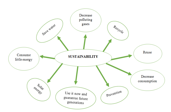
Figure 1. Conceptual map built with the sustainability theme

Starting the discussions on the activities that were developed during the project, it is important to remember that the referred study was carried out at the José Rolderick de Oliveira State School of Elementary and Secondary Education located in the city of Nova Floresta, Brazil, which included 30 students 2nd year of high school, of both sexes. During this study, activities were carried out, in which it was sought to identify the students' previous knowledge and understanding about the topic addressed. Initially, it was discussed in the classroom points that affect environmental education, based on sustainability. The damage caused to the environment in the present day was addressed, thus seeking the students' opinion in the form of a discussion to form points that would justify these students, which is sustainability. With this discussion, a conceptual map was created from the points that were expressed by the students, based on this, the following information was obtained described in Figure 1.