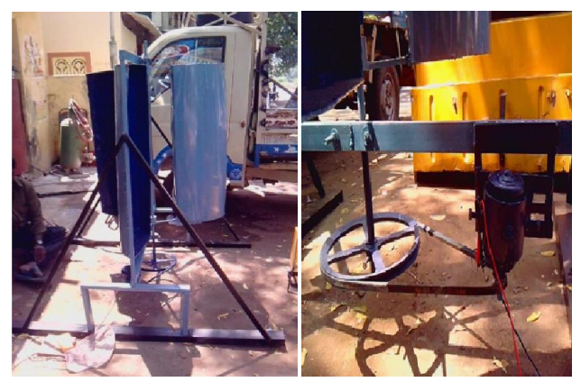
Fig. 1. Experimental Setup