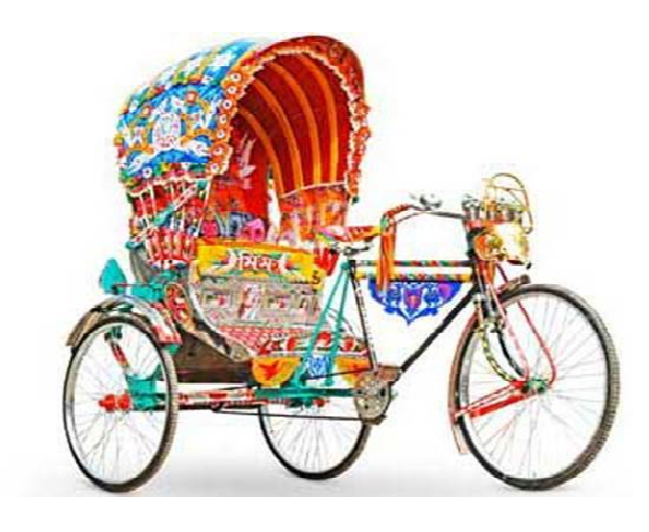
Image 1. Bangladeshi Cycle Rickshaw