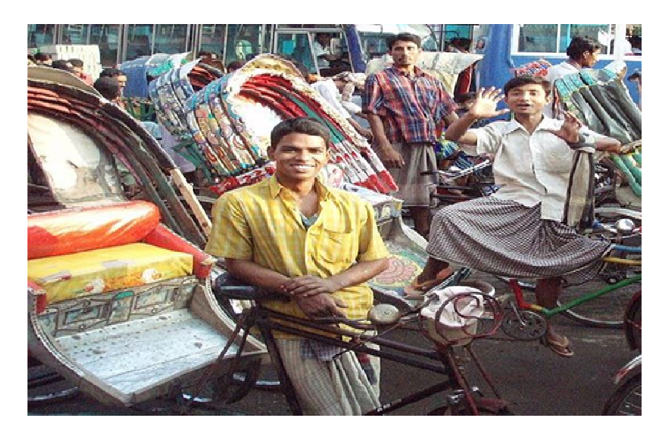
Image 2. Cycle Rickshaw Pullers in Dhaka city