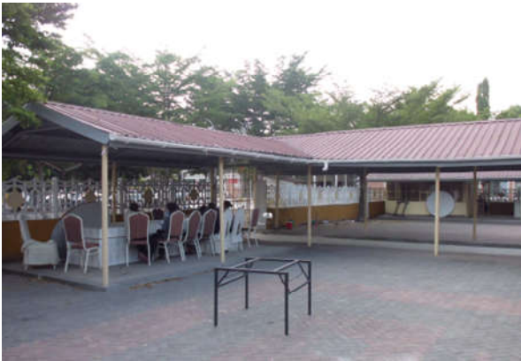
Figure 2. Bank Building within Msimbazi Parochial Human Settlements