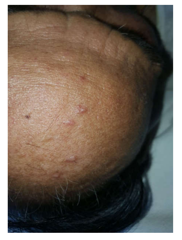
Figure 1. Clinical picture showing firm, mildly tender, erythematous to skin-colored and measured 5-50 millimeters in greatest dimension

The pattern consisted of grouped malignant cells, large hyperchromatic nuclei, prominent nucleoli with altered N: C ratio with acini formation (Figure 3). Subsequently, chest Xray (CXR) showed nodular densities in the perihilar zones (Figure 4). Ultrasonography of liver revealed hypoechoic lesions (Figure 5). Computed tomography of chest revealed multiple nodular opacities scattered in bilateral lungs and mediastinal lymphadenopathy. Computed tomography of abdomen revealed multiple necrotic lymphadenopathy in mediastinal, peri pancreatic and paravertebral regions. The patient was referred to oncology department in a tertiary care hospital and was lost to follow up