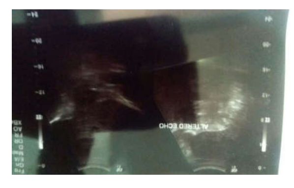
Figure 5. USG showing hypoechoic lesions in liver