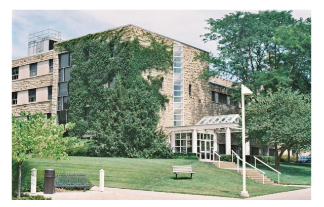
Figure 2: The use of climbers and trees to reduce solar heat penetration.

The main objective of this study is to find out whether soft landscape elements are part of the building and environmental design in such a city like Akure , Nigeria, which is one of the typical cities in the tropics which receives high solar radiation throughout the year. This paper reports the status of the availability of soft landscape elements such as trees, shrubs, grasses, climbers, etc. in Akure, Nigeria, that can assist in reducing solar heat gains and contribute immensely to reduction in cooling loads for thermal comfort in buildings. This, combined with other passive strategies to combat high solar heat gains in tropical buildings will go a long way to achieve a sustainable buildings and environment.